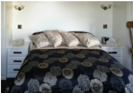
Rear 'double' bedroom

Please let us know if you have any special needs and we will do our utmost to help you, if we can.