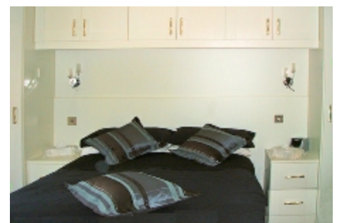
Front 'double' bedroom