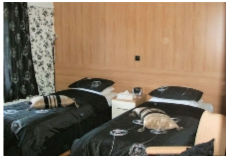
Rear 'twin'/'super king-size' Double bedroom