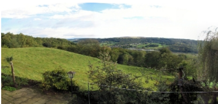
View from conservatory

Surrounded by ancient moors and woodlands teeming with wildlife, Woodside , situated on the Southern Plateau of the Peak District National Park, offers panoramic views over the Derwent Valley below to the moors above Chatsworth.