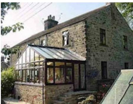
Conservatory breakfast room